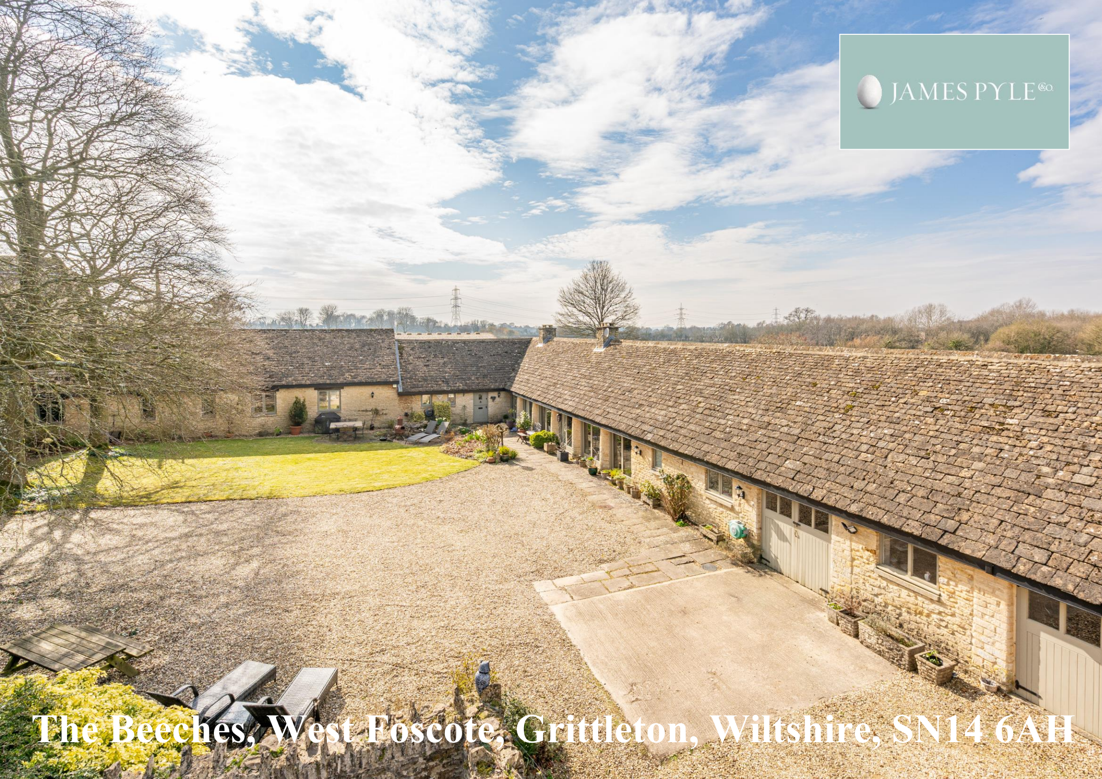
The Beeches, West Foscote, Grittleton, Wiltshire, SN14 6AH