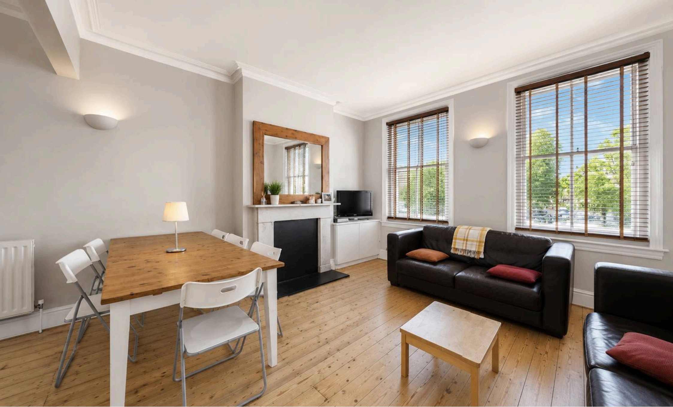
Uxbridge Road, London, W12