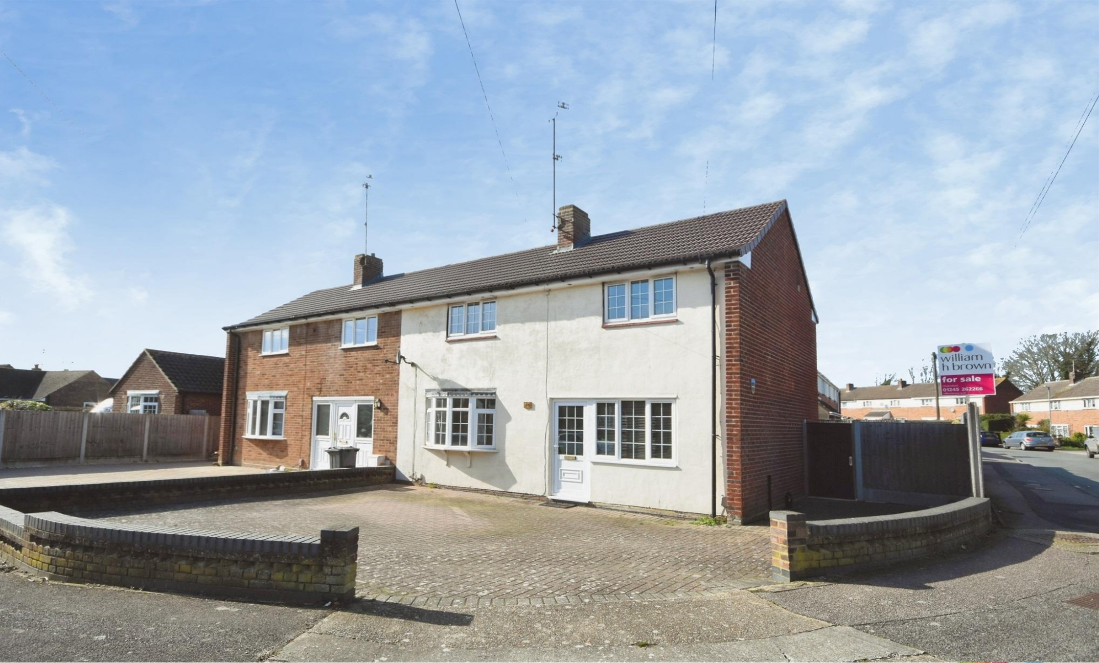
Peel Road, Chelmsford CM2 6AH