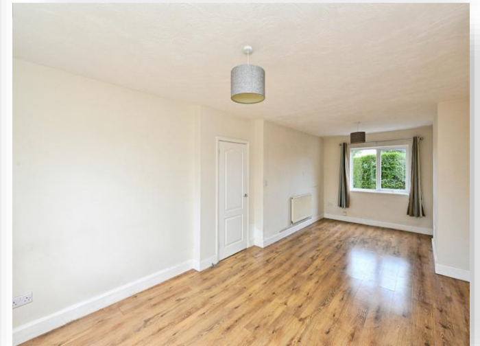
Queen Mary Road, Gaywood, King's Lynn, PE30 4QF