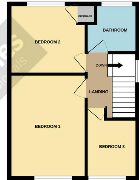
1ST FLOOR 34.8 sq.m. (375 sq.ft.) approx.