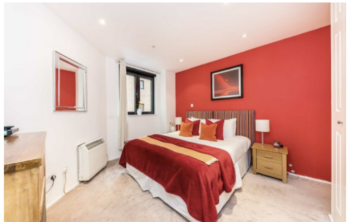
Cromwell Road, SW7