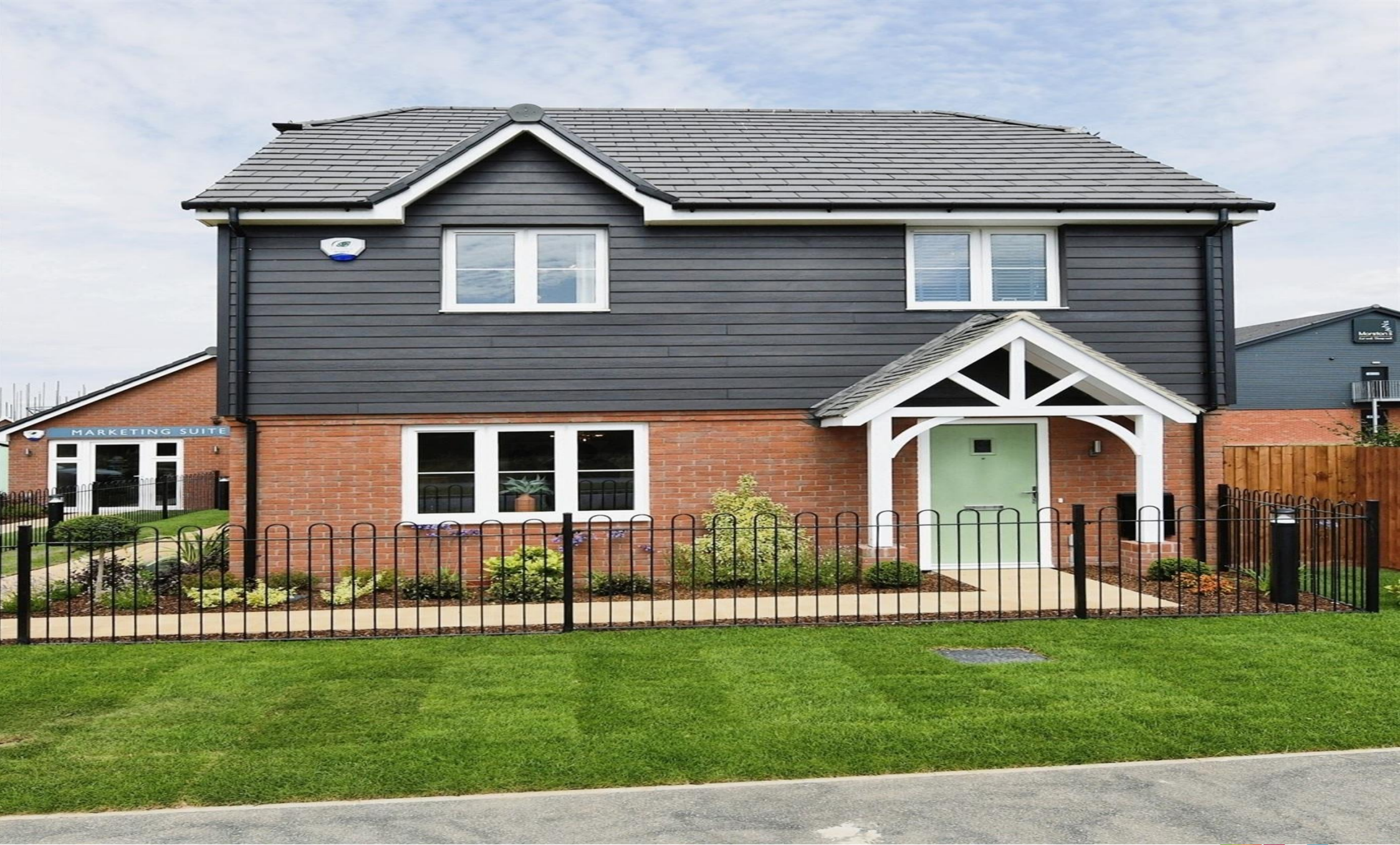
The Colne Meadow Gardens, Hartley Brook Road Clacton-On-Sea CO16 9GA