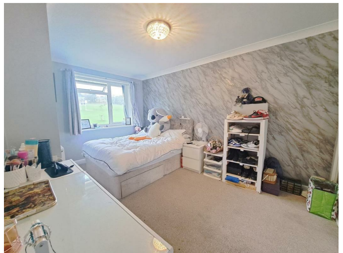
Bedroom Two 13'5 x 9'5 (4.09m x 2.87m)