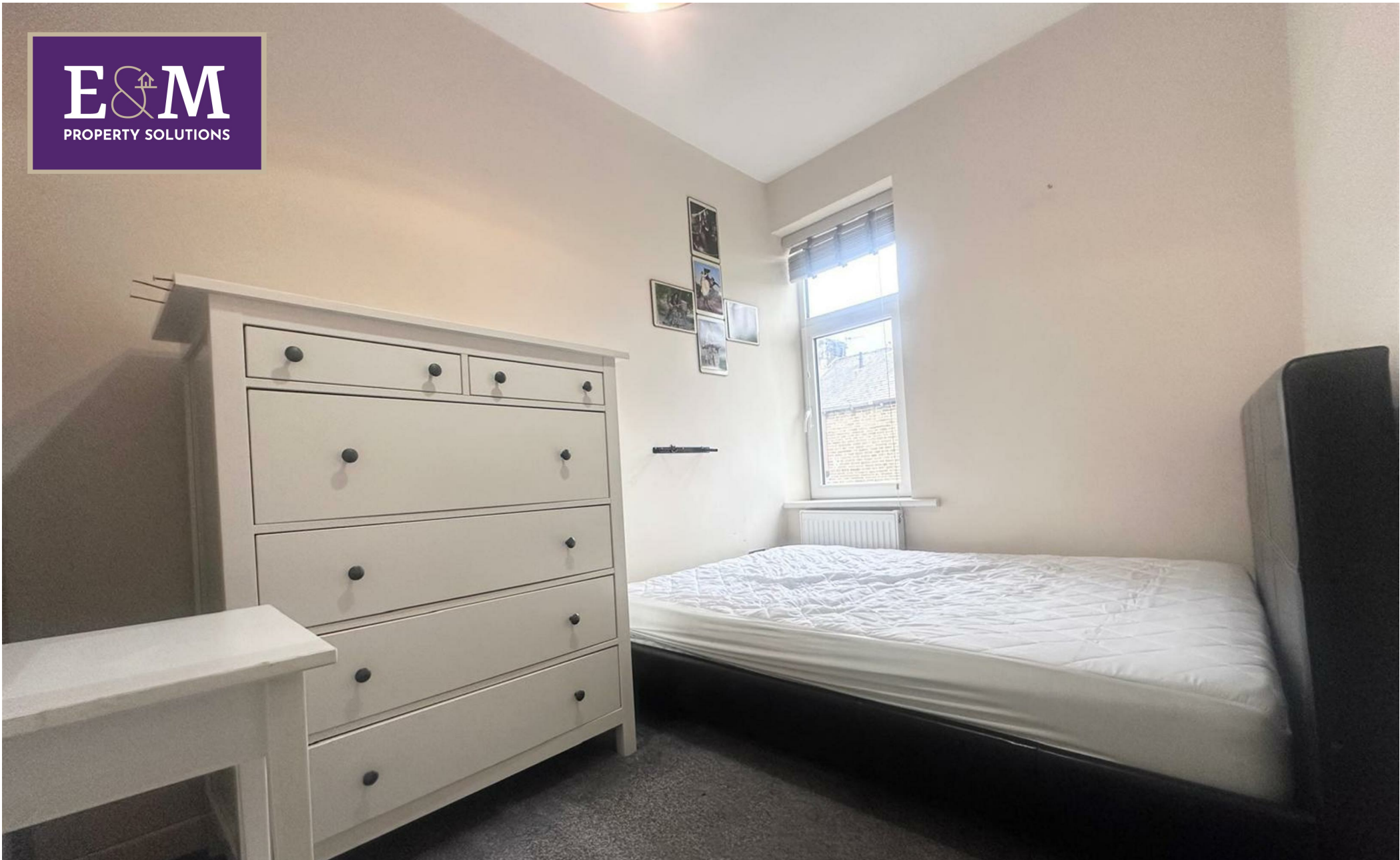
ROOM 2, 8 Hinton Street, Burnley, Lancashire, BB10 4EB £90 Per week