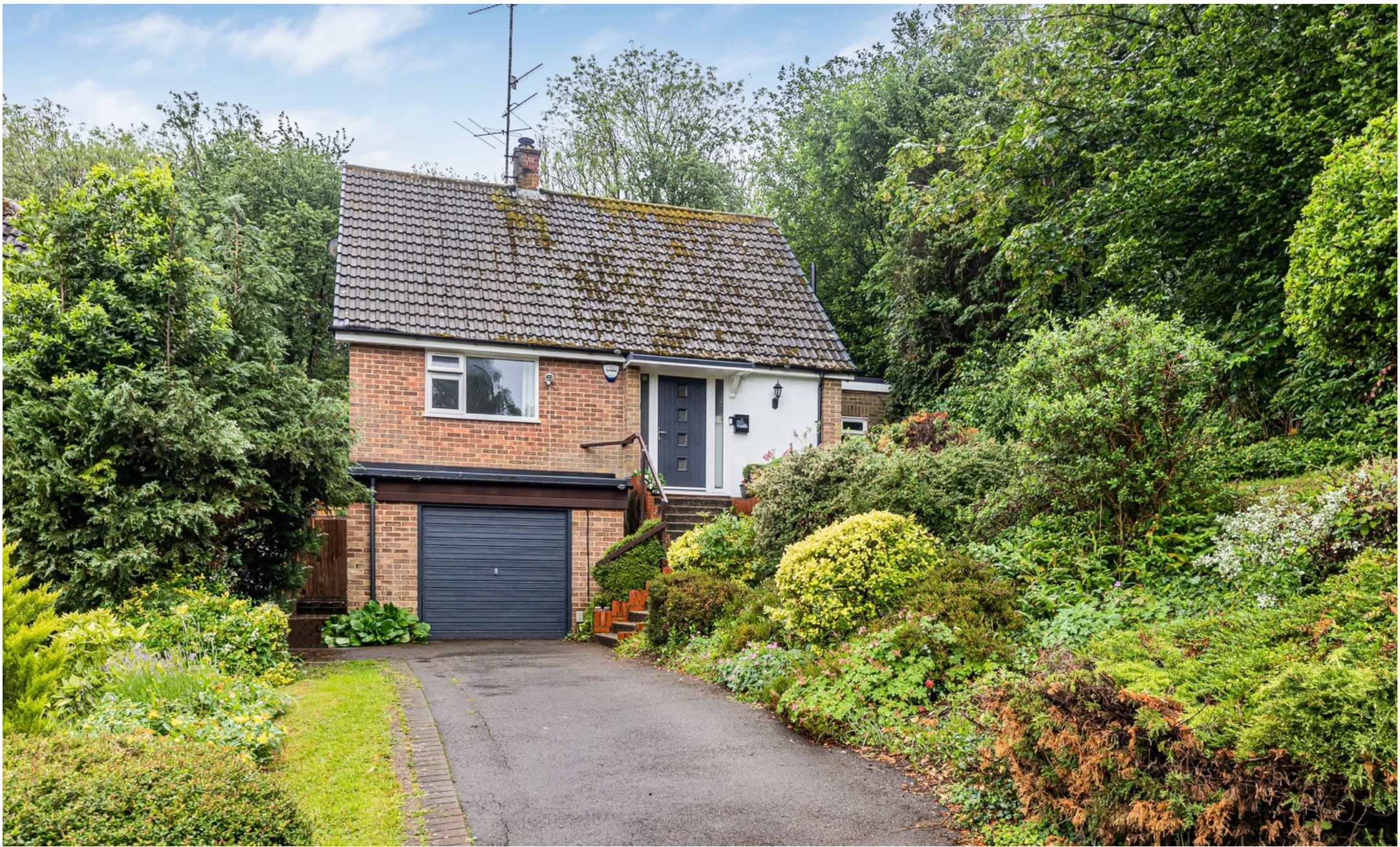
5 Burford Close Marlow