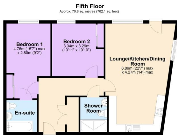
Total area: approx. 70.8 sq. metres (762.1 sq. feet)