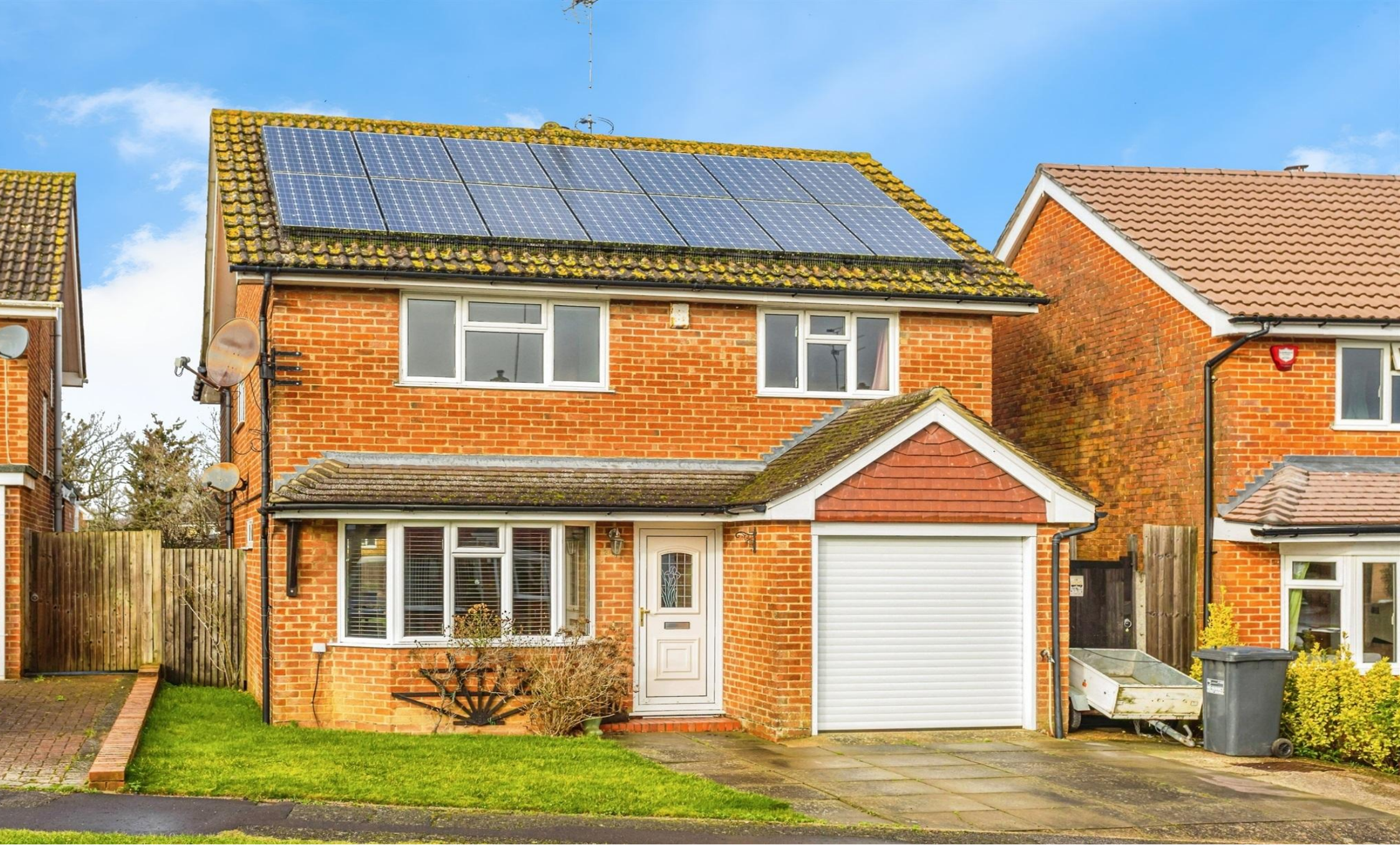
Meadow Lane, Burgess Hill, RH15 9JE