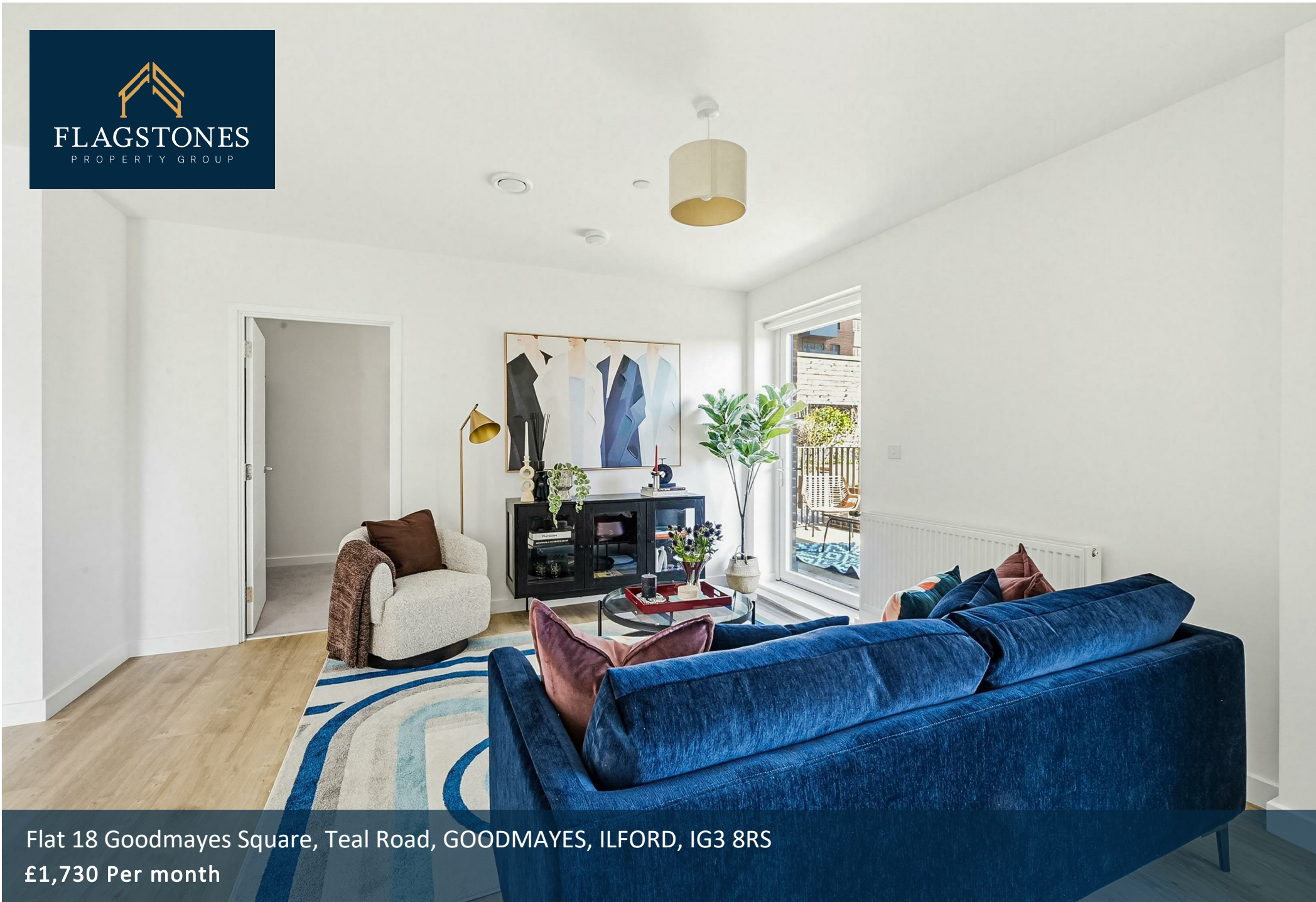
Flat 18 Goodmayes Square, Teal Road, GOODMAYES, ILFORD, IG3 8RS £1,730 Per month