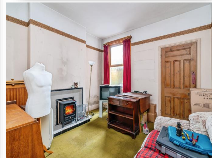
Fleeman Grove, West Bridgford Nottingham NG2 5BH