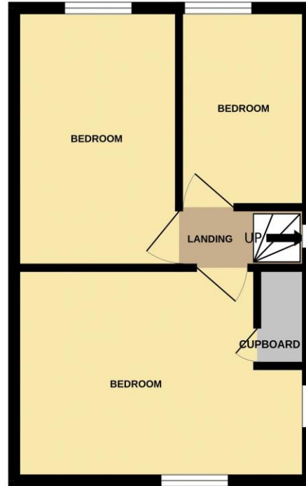
FIRST FLOOR 329 sq.ft. (30.5 sq.m.) approx.