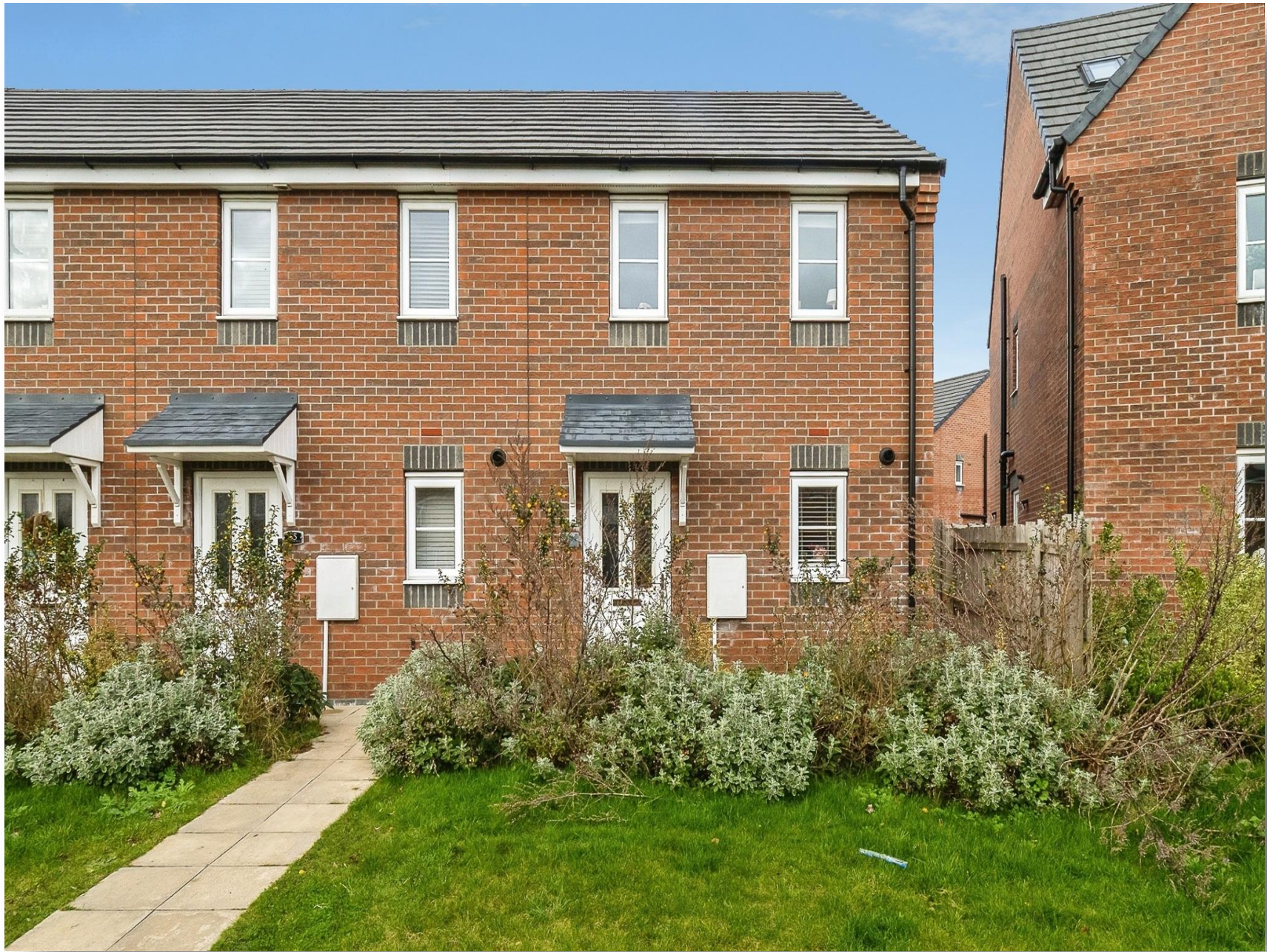
Grosvenor Road, Kingswood, Hull, HU7 3DS