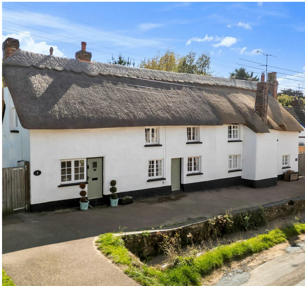
Bank House, 66 High Street, Honiton, Devon, EX14 1PS

IMPORTANT: Stags gives notice that: 1. These particulars are a general guide to the description of the property and are not to be relied upon for any purpose. 2. These particulars do not constitute part of an offer or contract. 3. We have not carried out a structural survey and the services, appliances and fittings have not been tested or assessed. Purchasers must satisfy themselves. 4. All photographs, measurements, floorplans and distances referred to are given as a guide only. 5. It should not be assumed that the property has all necessary planning, building regulation or other consents. 6. Whilst we have tried to describe the property as accurately as possible, if there is anything you have particular concerns over or sensitivities to, or would like further information about, please ask prior to arranging a viewing.