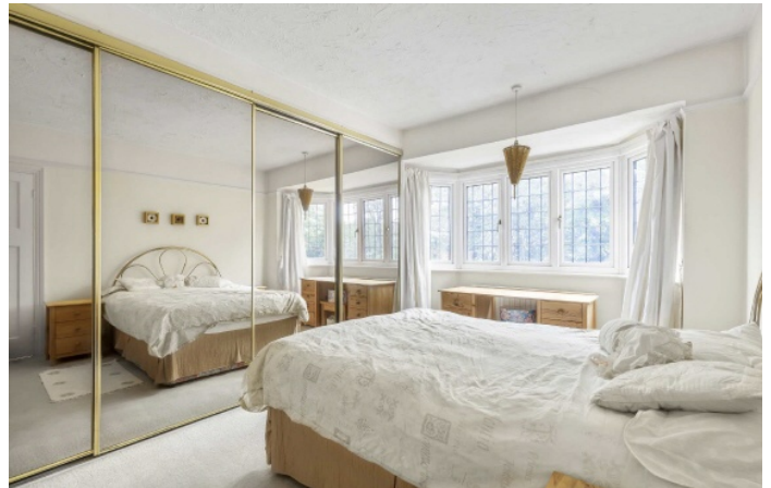
Manor Gardens, TW16