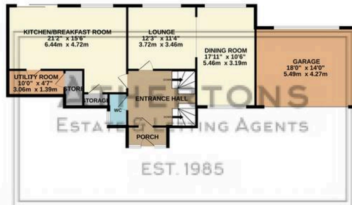
GROUND FLOOR 1096 sq.ft. (101.9 sq.m.) approx.