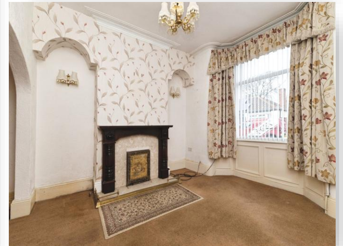
Millfield Road, Middlesbrough TS3 6ES