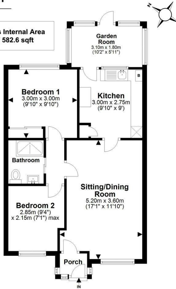
Illustration for identification purposes only; measurements are approximate, not to scale. www.fpusketch.co.uk Plan produced using PlanUp.

Approx Gross Internal Area 54.1 sqm / 582.6 sqft