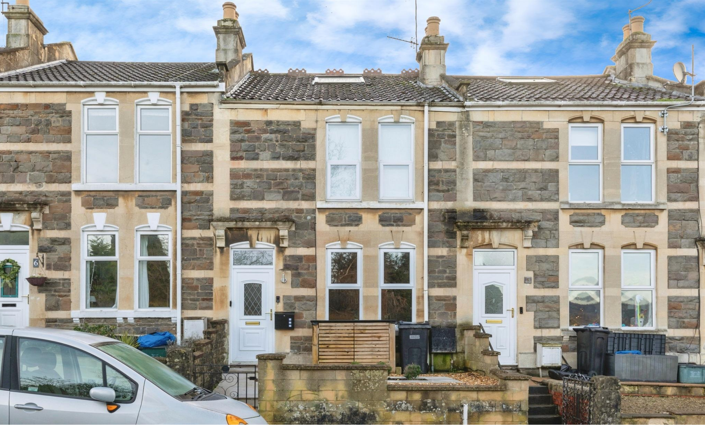
Lymore Avenue, Bath BA2 1BA