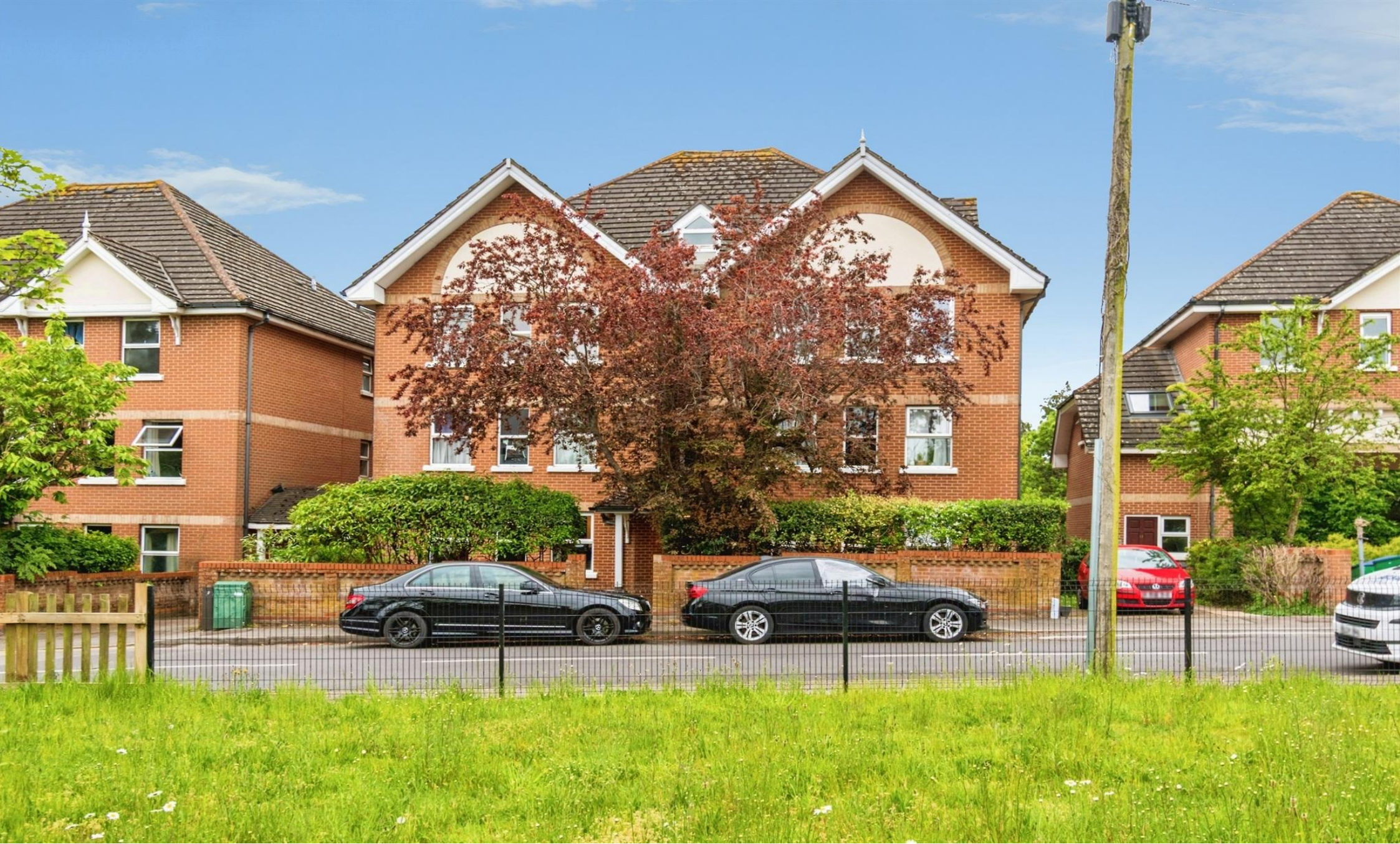
Daneway House, Westridge Road, SOUTHAMPTON SO17 2AH