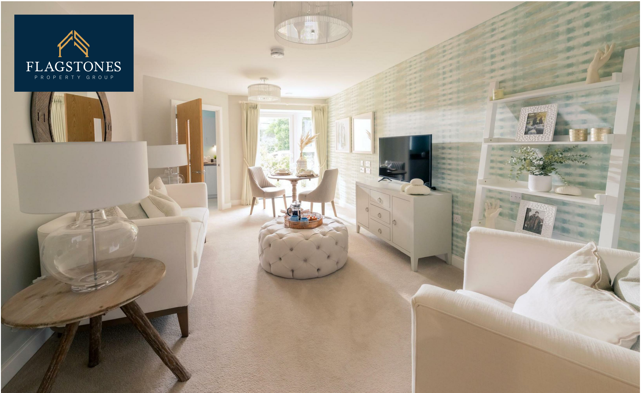
5342543 Charlton Green, Elkington House, Dover, CT16 1AP £102,500