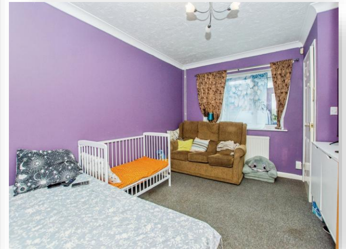
Tindall Close, Wisbech PE13 3QT