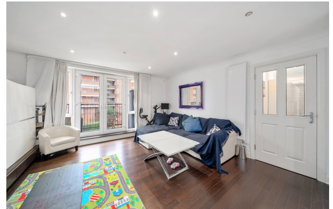
ESPIRIT HOUSE, KESWICK ROAD SW15