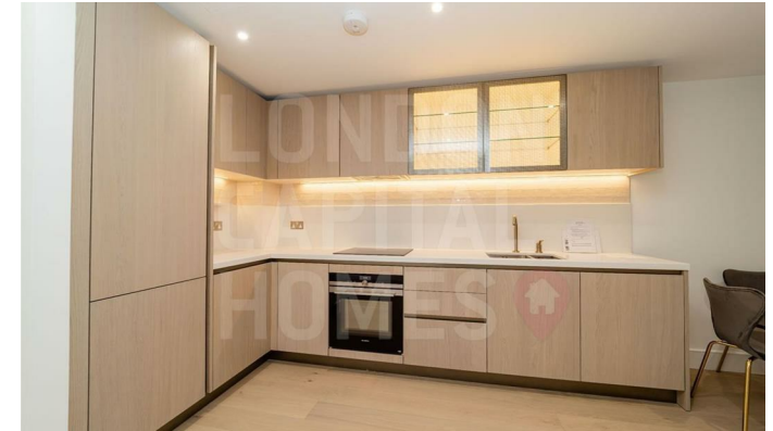
Salisbury House 1 Bed Apartment