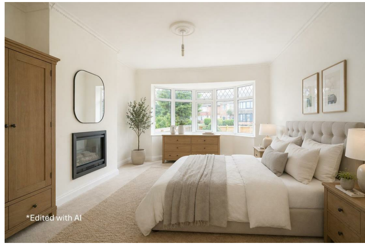
*Edited with AI