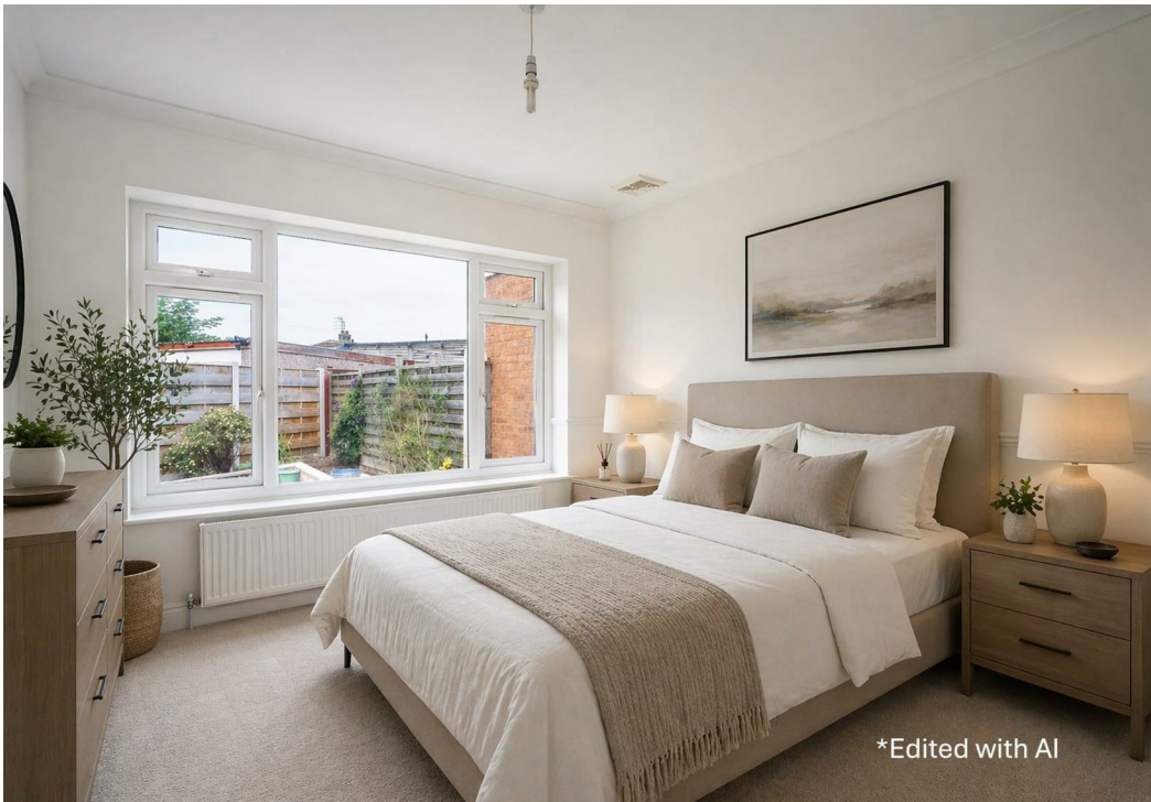
*Edited with AI