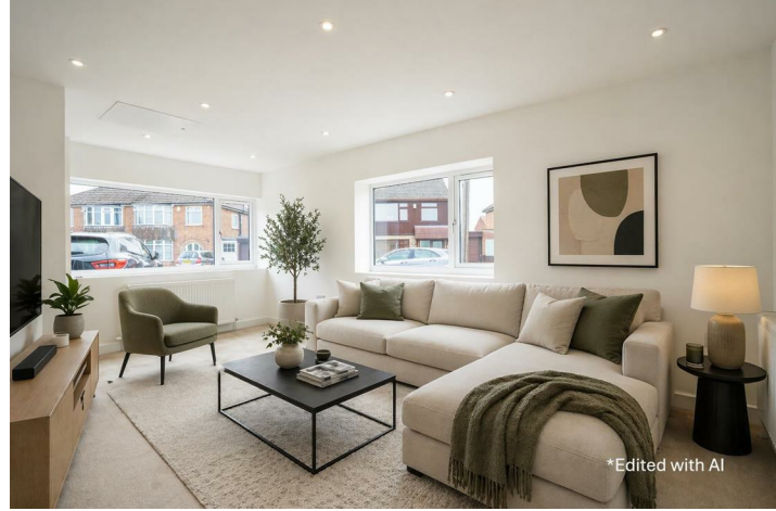
*Edited with AI