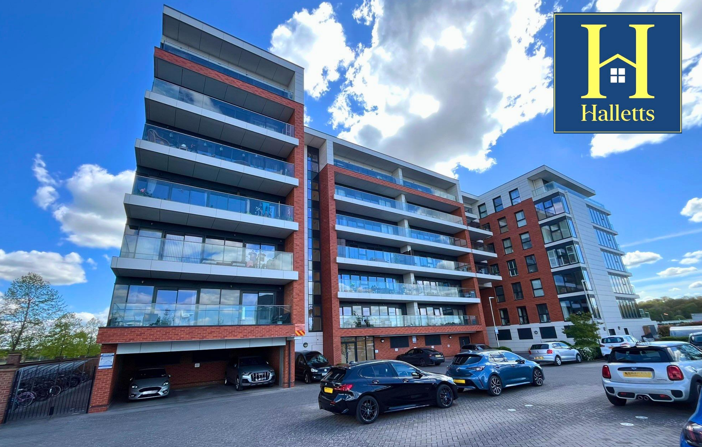
1 Southmead House, Kingman Way, Newbury, Berkshire, RG14 7FY