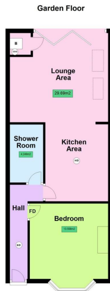
Flat 1, 2 Victoria Terrace, Westmoreland, Bath