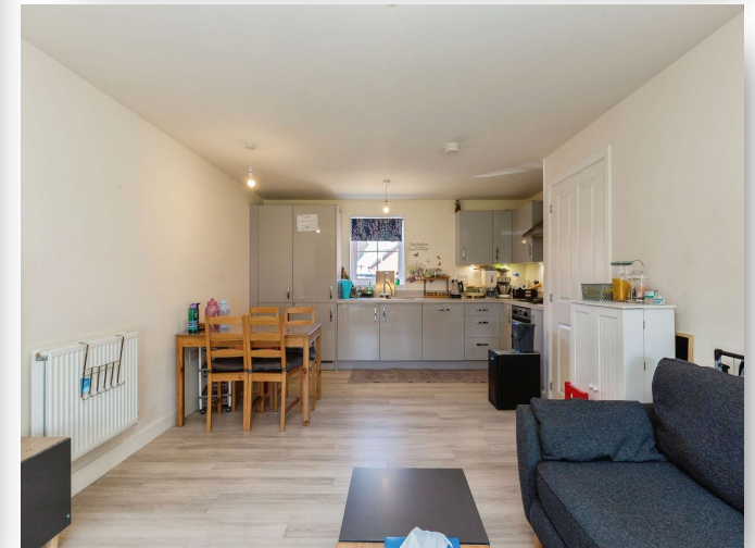
Brewery Lane, Broughton Aylesbury HP22 7DH