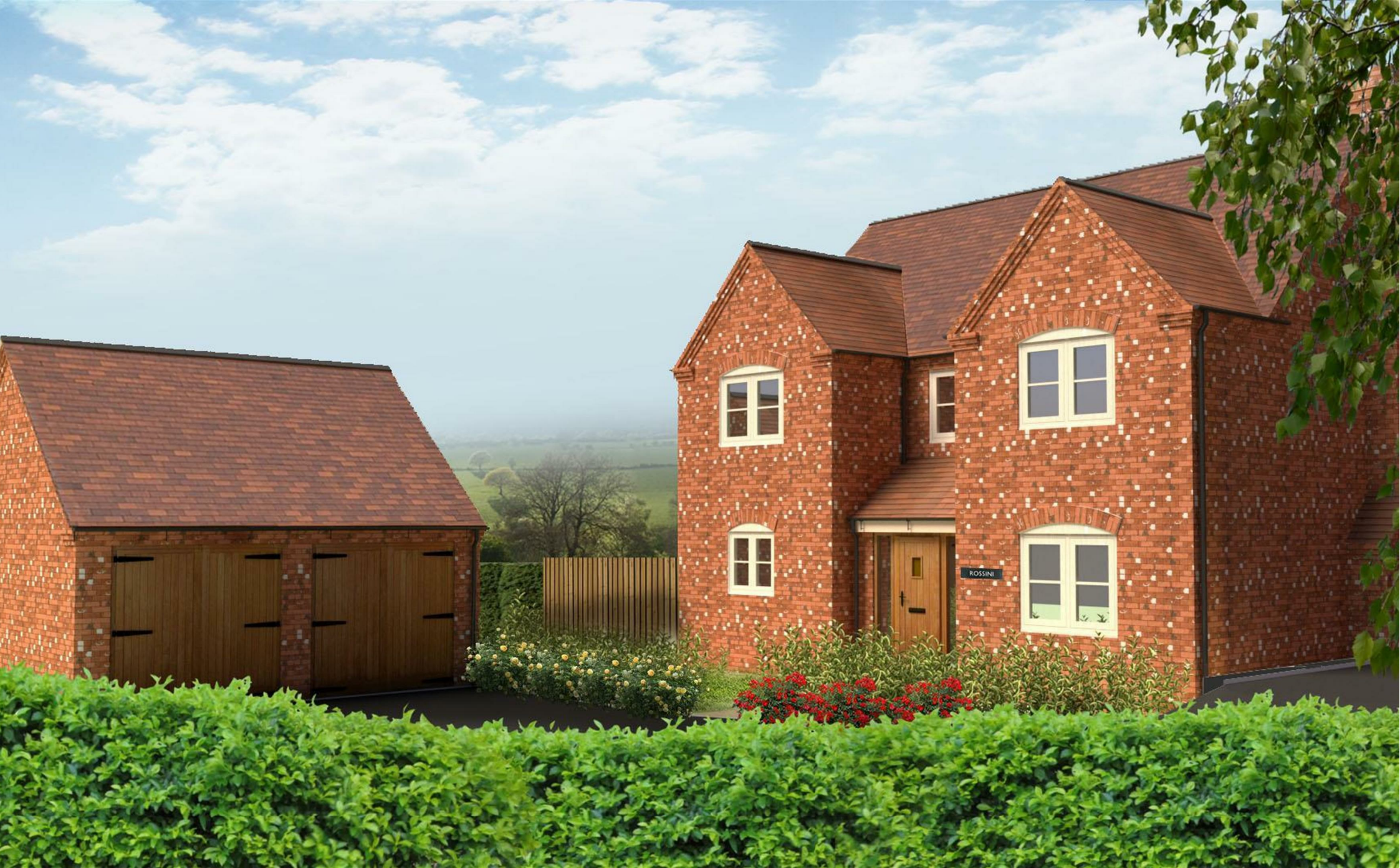
Plot 5: Rossini, High View Lichfield Road, Abbots Bromley, Staffordshire, WS15 3DL