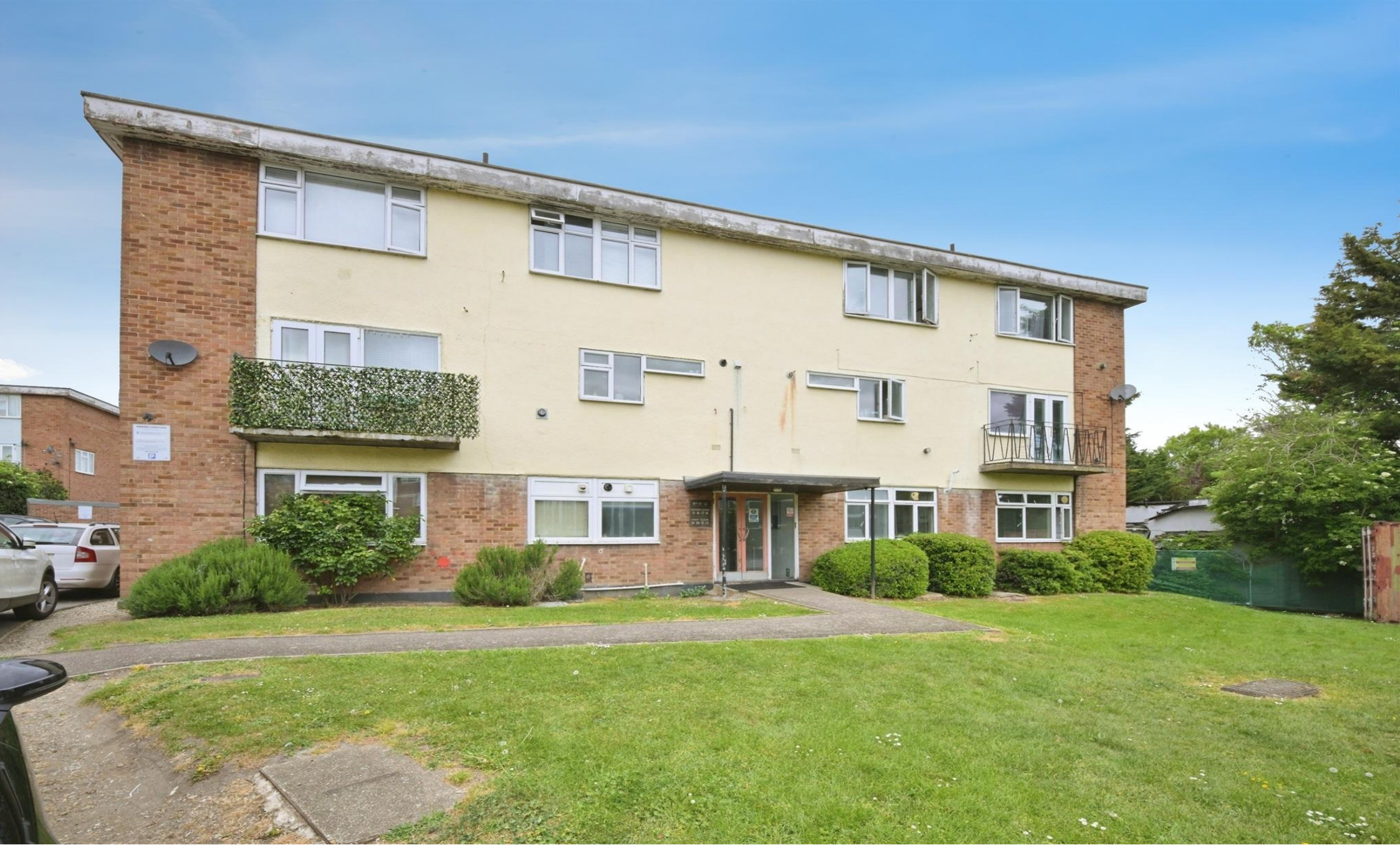
Amberry Court, Harlow CM20 2PX