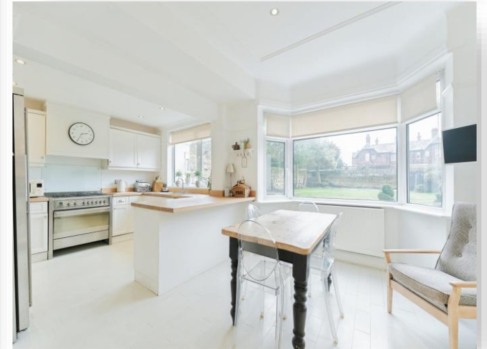
Brancote Road, Oxton, Prenton, CH43 6TL