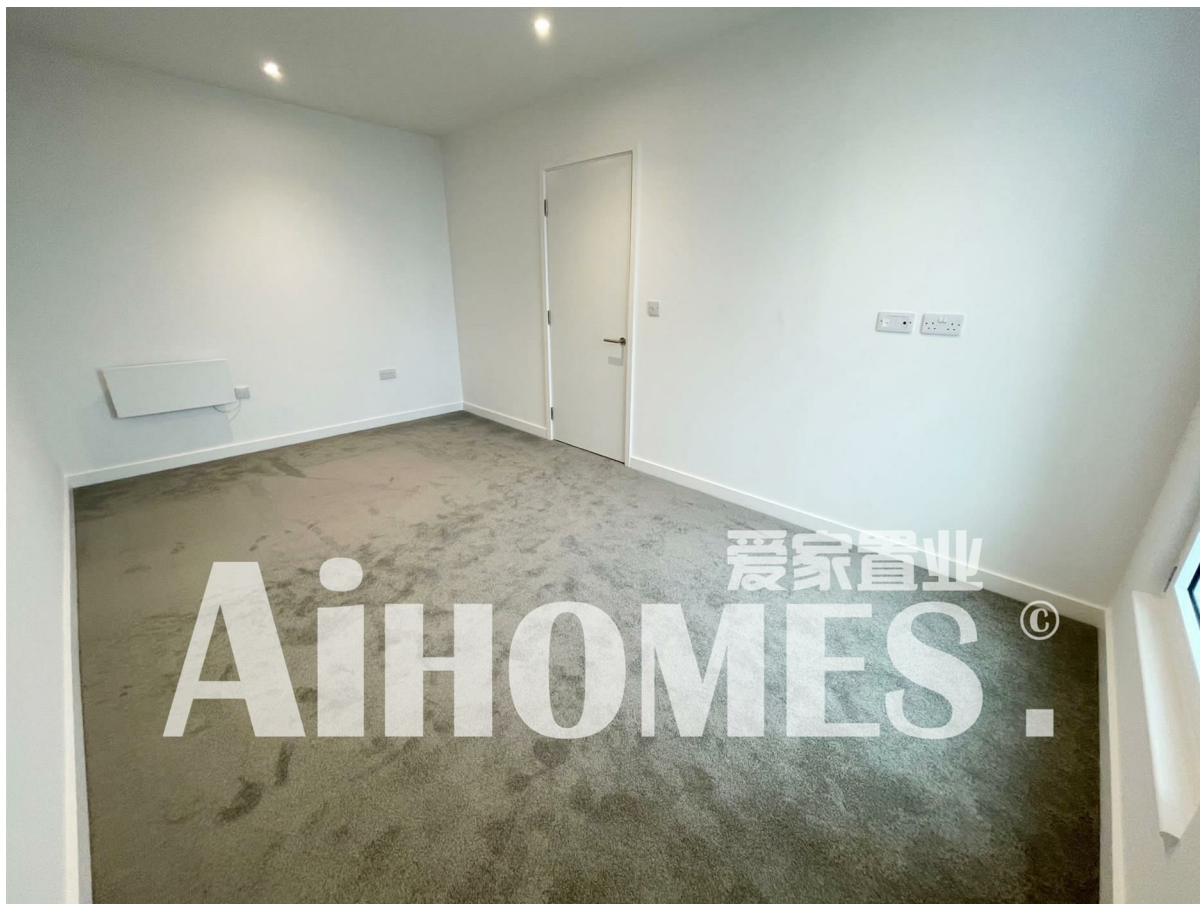
Spacious 2B2B Apartment in No.1 Old Trafford | 2012005TW