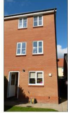
29 Horn-Pie Road • Norwich • NR5 9PW