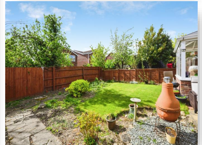
Birch Close, Yaxley Peterborough PE7 3HD