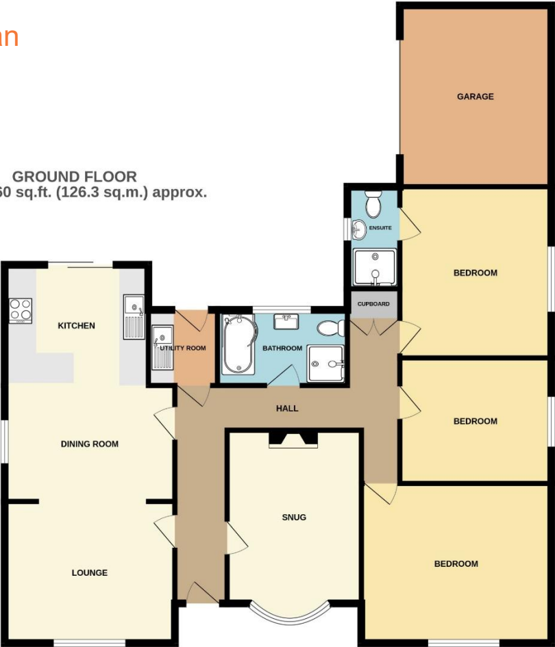
BUNGALOW, DUNSTON FEN LANE

GROUND FLOOR 1360 sq.ft. (126.3 sq.m.) approx.