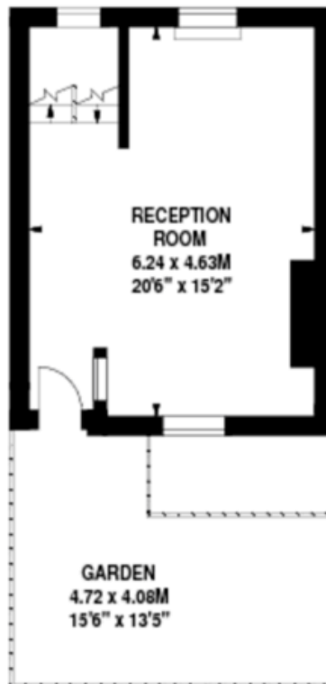
Ground Floor 308 sq ft