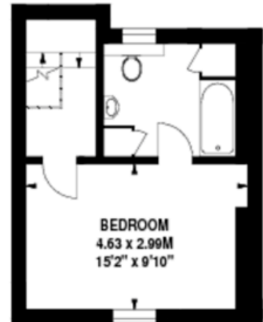
Second Floor 280 sq ft