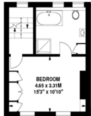
First Floor 309 sq ft