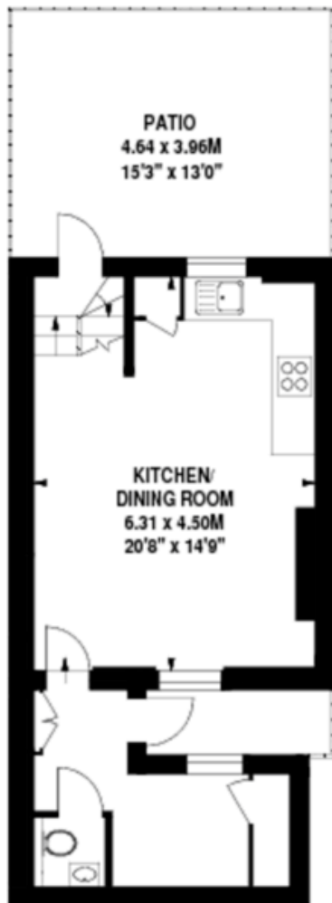
Lower Ground Floor 410 sq ft

Approximate gross internal area 121.27 sq m / 1305 sq ft