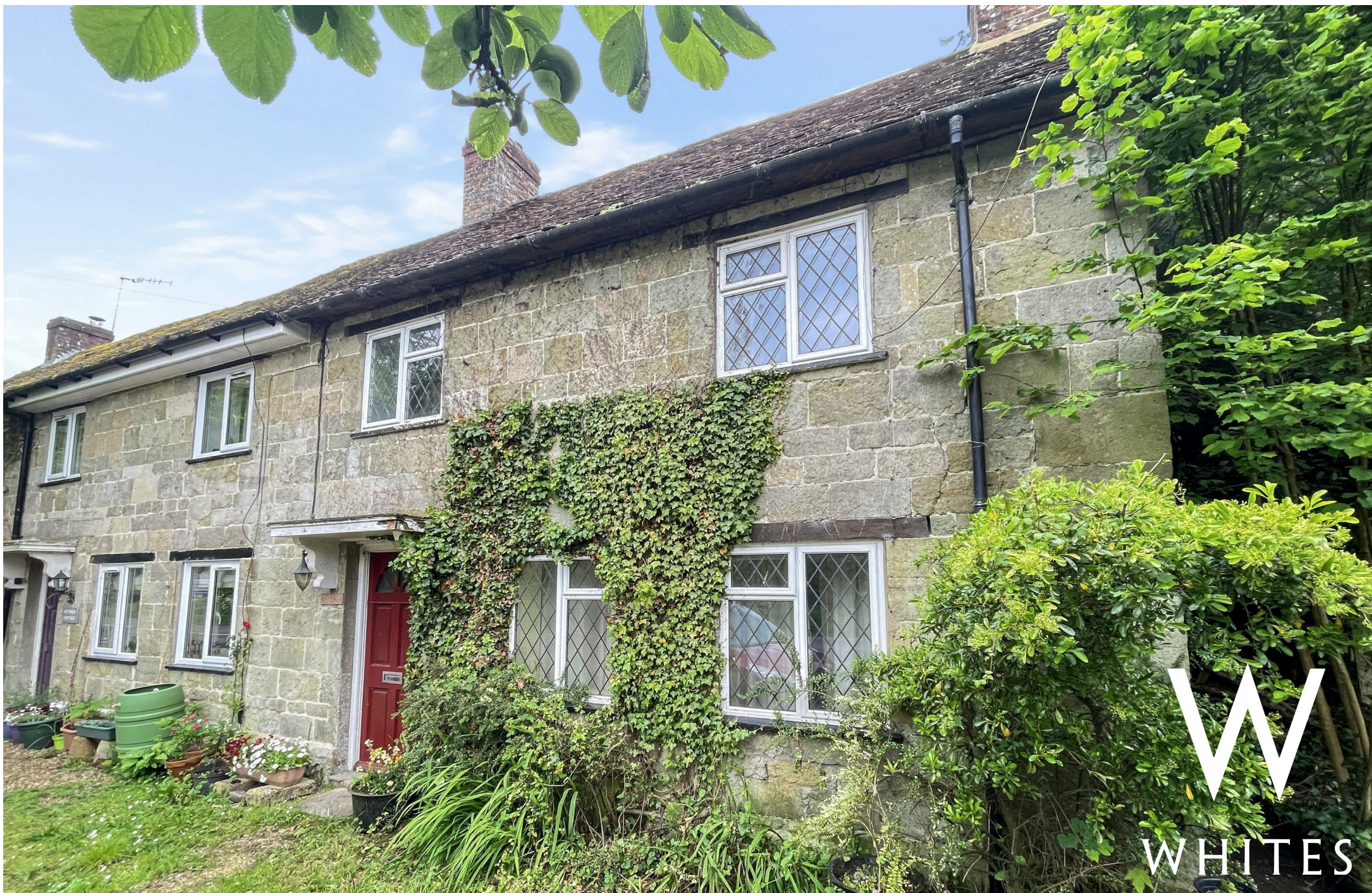
Postmans Cottage, Shaftesbury Road, Compton Chamberlayne, Wiltshire, SP3 5DJ