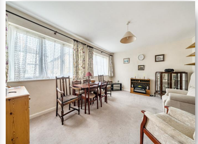
8 Suffolk Court, Vicarage Road, Maidenhead SL6 7DT