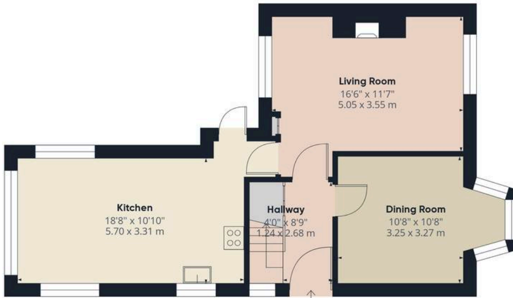
First Floor Building 1