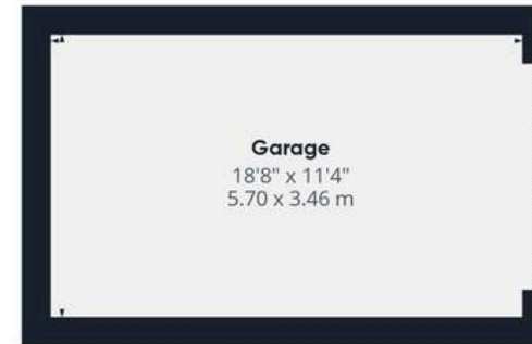
First Floor Building 2