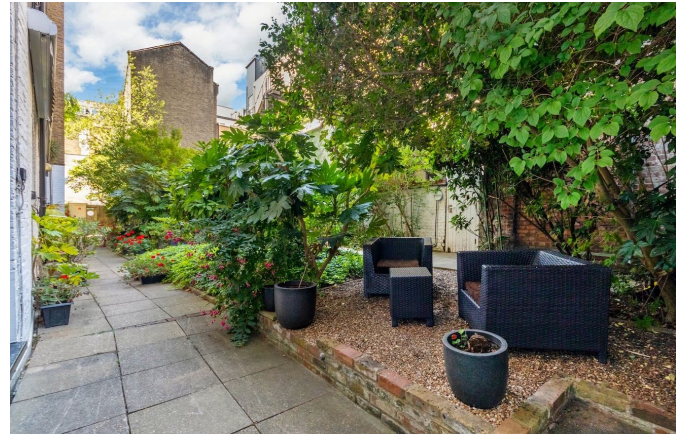
LINCOLN HOUSE, BASIL STREET, KNIGHTSBRIDGE, SW3