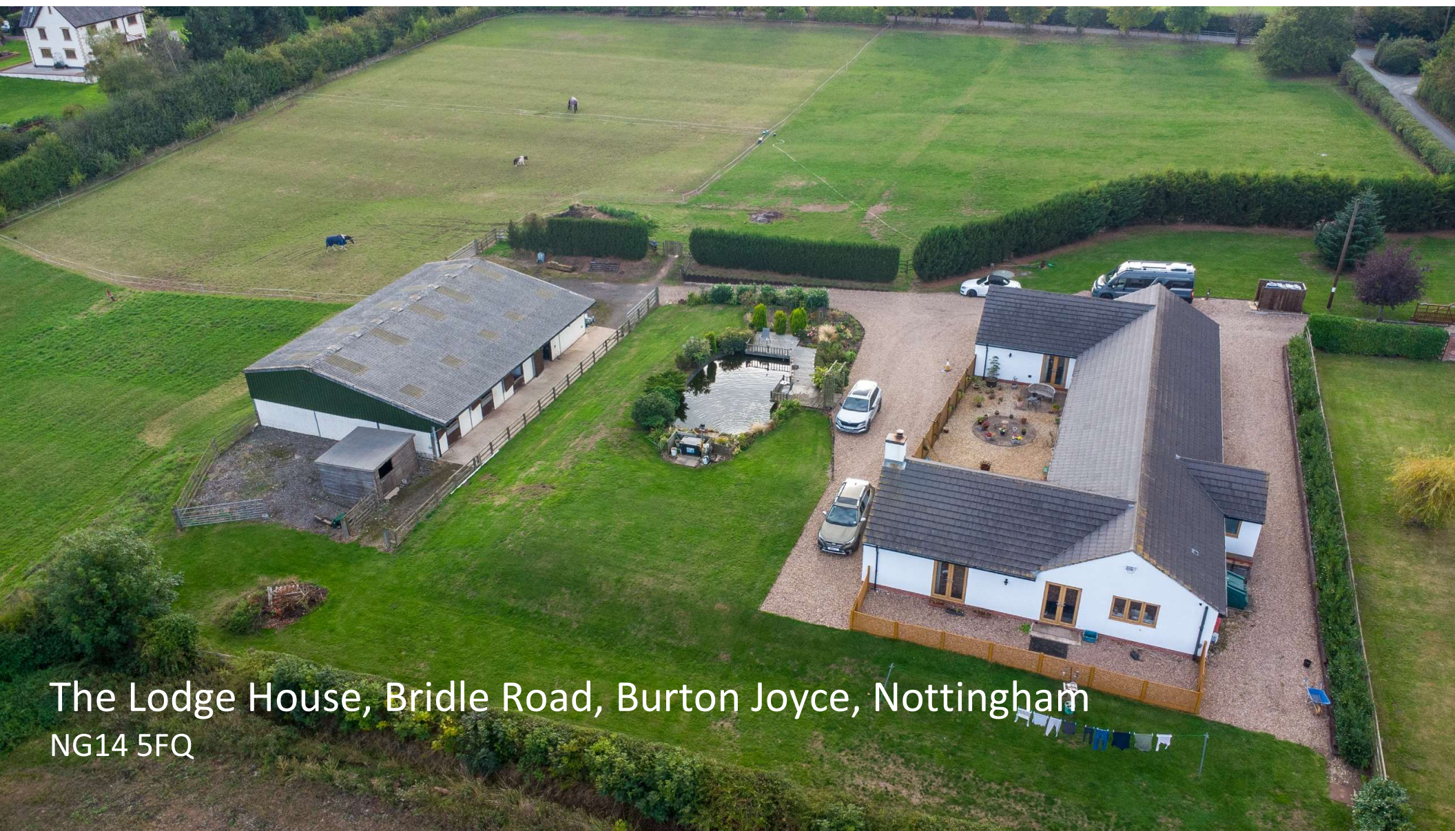
The Lodge House, Bridle Road, Burton Joyce, Nottingham NG14 5FQ

Consultative Estate Agents with Integrity