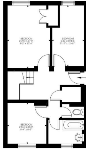
Second Floor 482 ft 2