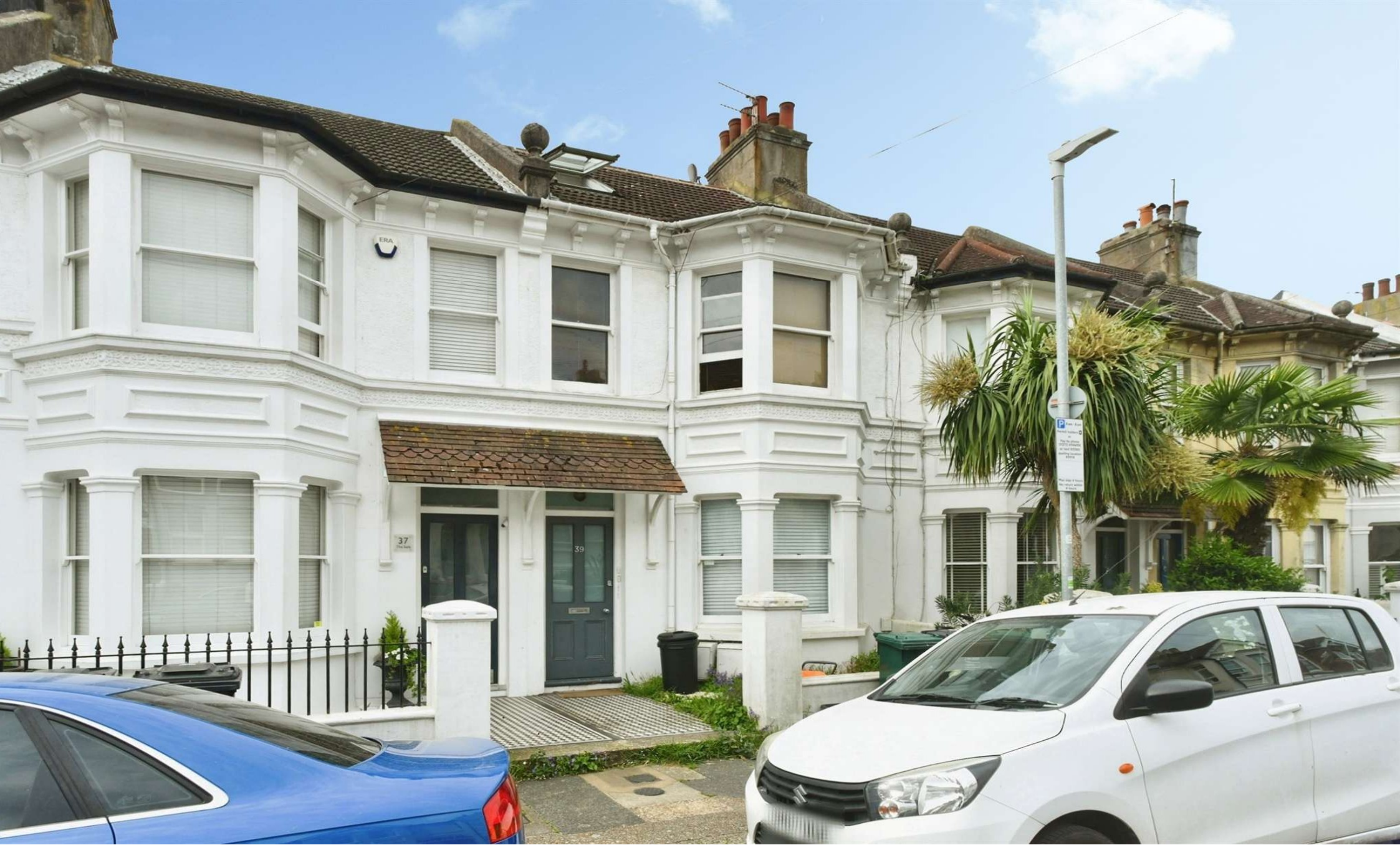
Prinsep Road, Hove BN3 7AB