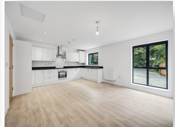
Maythorn House Trent Lane, Nottingham NG2 4DS