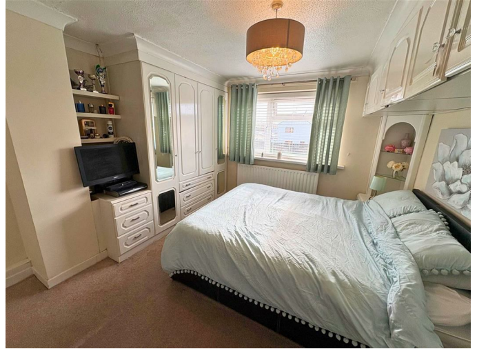
Bedroom One 11'1" x 12'4" (3.38 x 3.76)

Textured and coved ceiling, skimmed walls, fitted carpet, radiator, built-in wardrobe, storage cupboard housing the gas combination boiler, uPVC double glazed window to the front.