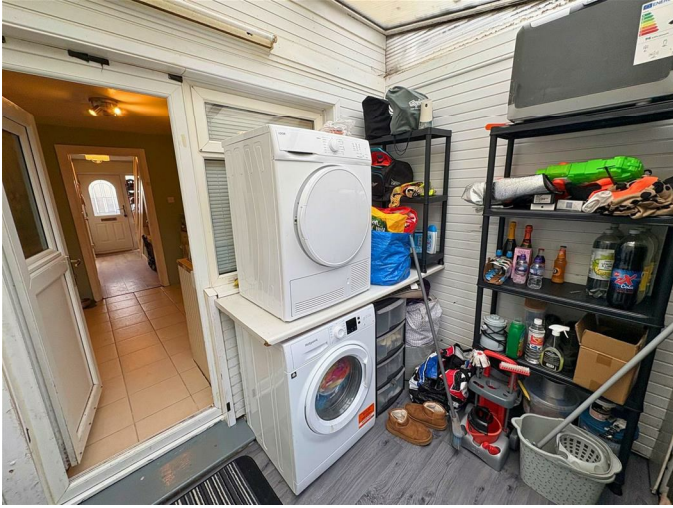
Lean-to / Utility Area 20'0" (approx.) x 6'0" (6.1 (approx.) x 1.83)

Polycarbonate roof, PVC panelling surrounding, wood effect vinyl flooring, radiator, uPVC double glazed window looking into the lounge / diner, door into the storage shed, uPVC double glazed windows surrounding, uPVC double glazed door to the rear providing access into the rear garden.