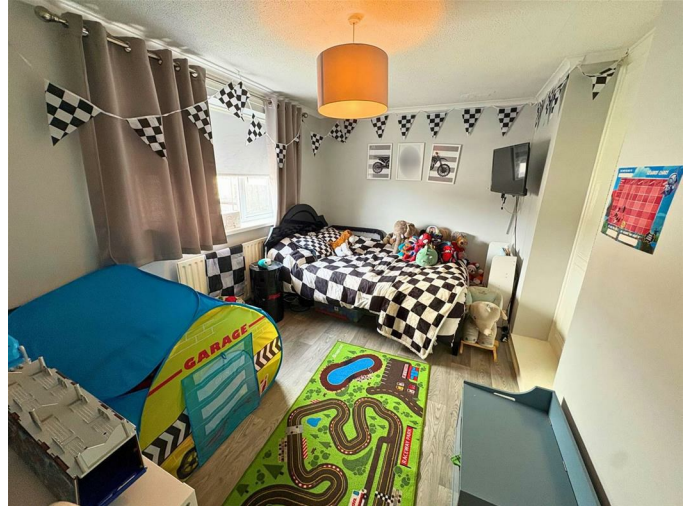
Bedroom Two 12'4" x 8'5" (3.78 x 2.57)

Textured and coved ceiling, skimmed walls, wood effect vinyl flooring, radiator, built-in wardrobe, uPVC double glazed window to the rear.