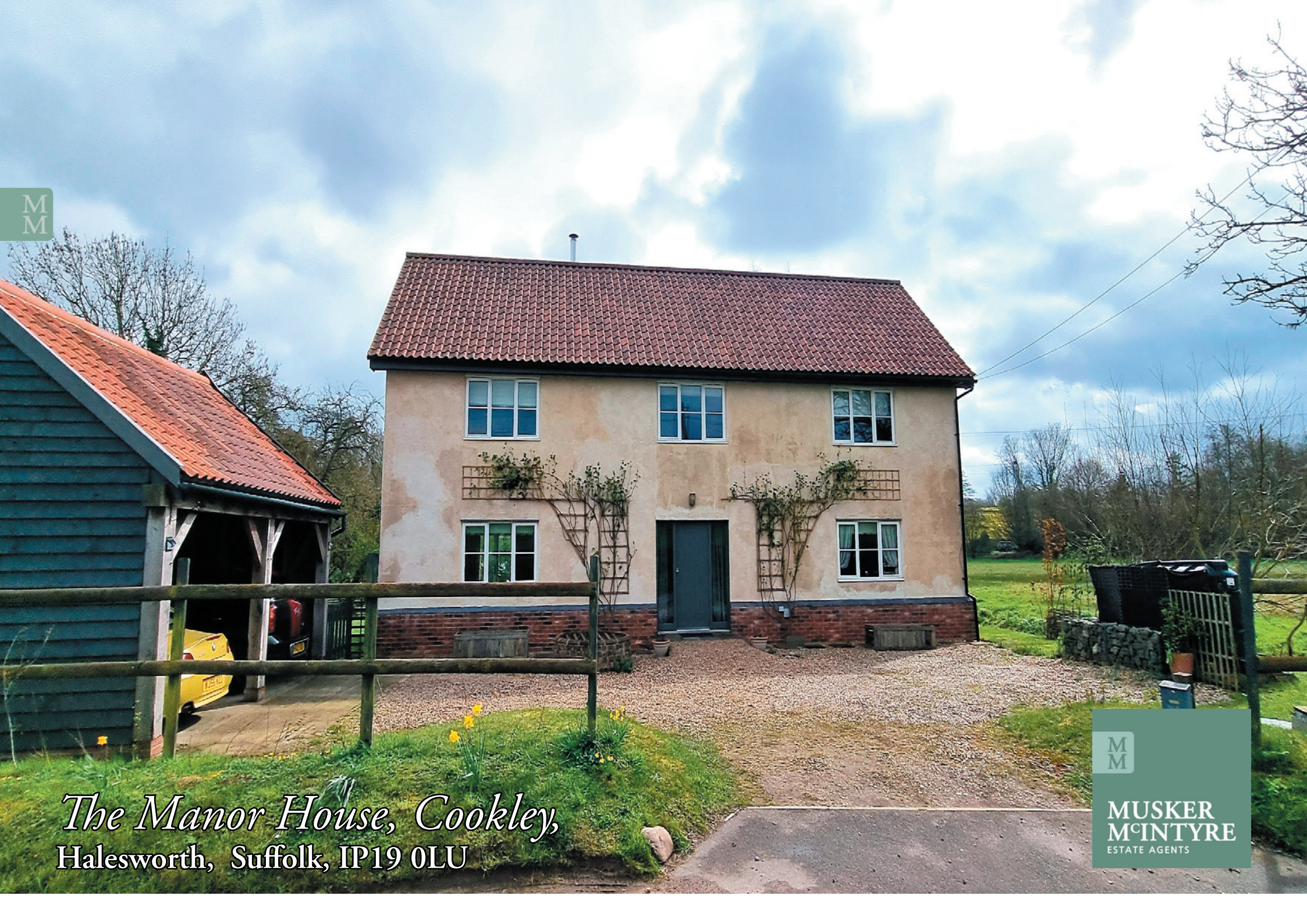
The Manor House, Cookley, Halesworth, Suffolk, IP19 0LU