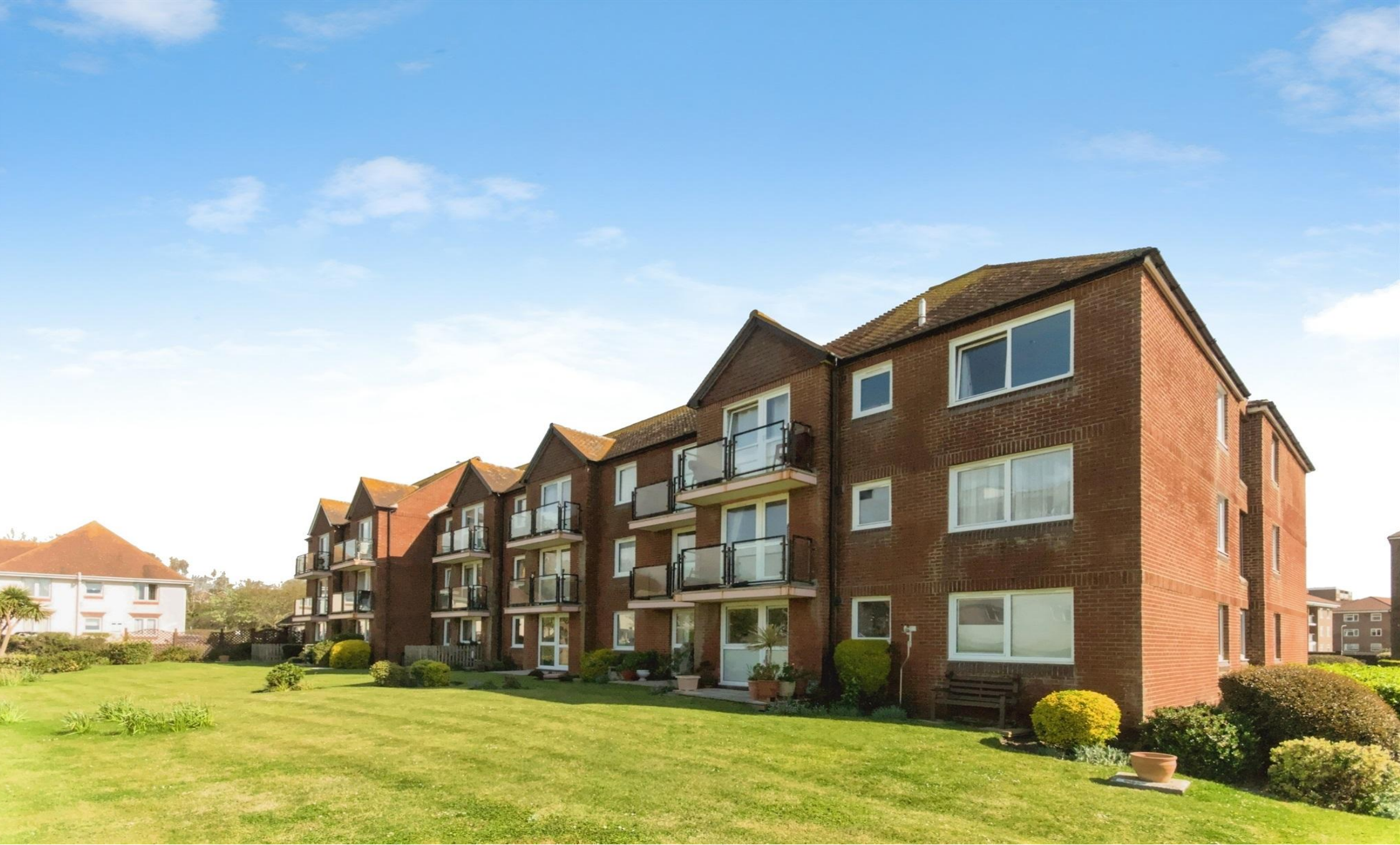
Homelawn House - Brookfield Road, Bexhill-On-Sea TN40 1PN